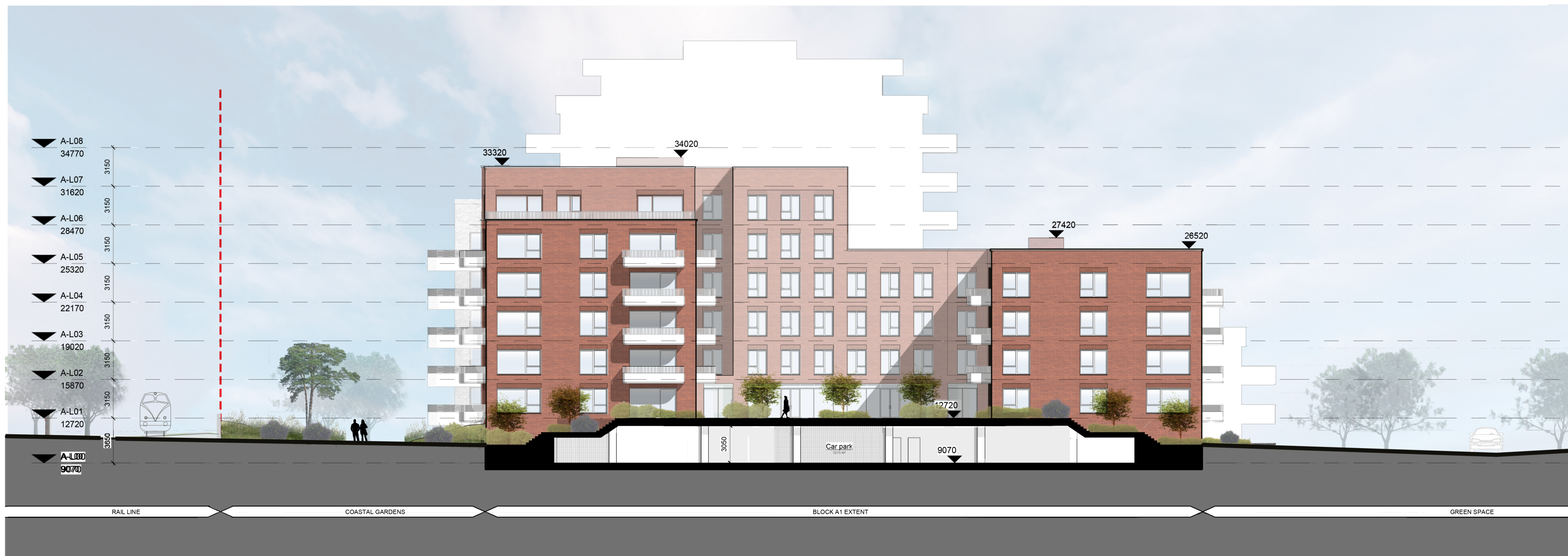
Block A - Section BB 1 : 200